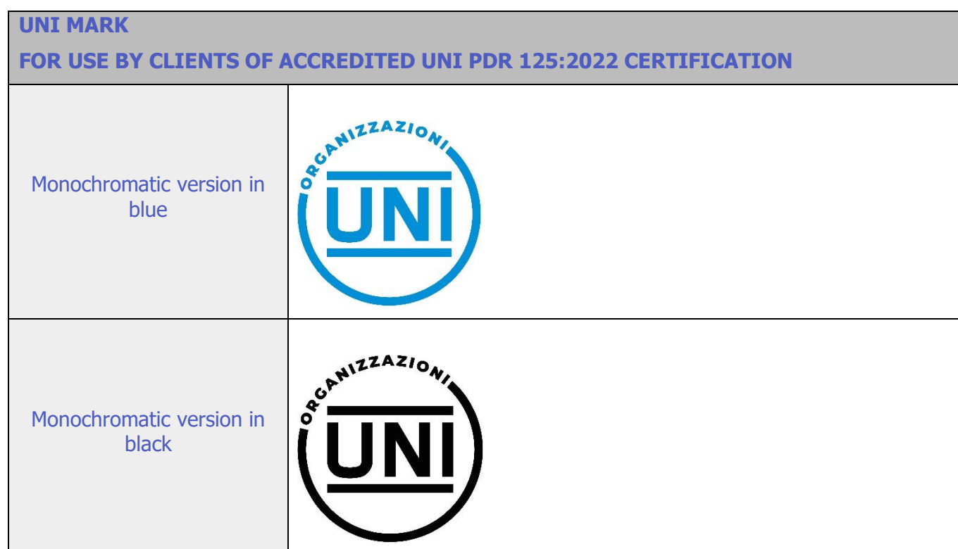
Figure 3: UNI Mark for use by clients of UNI PDR 125_2022 accredited certification

The dimensions of UNI mark must not exceed those of BSI mark.