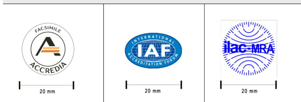
Figure 3: Minimum widths permitted of the Accredia Mark