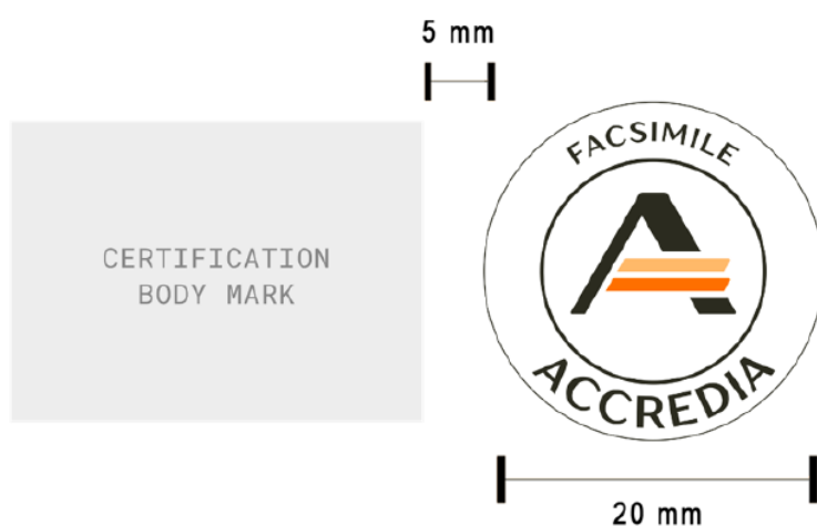
Figure 4: For use by BSI clients

For use by clients of accredited Certification, Inspection, Verification and Validation Bodies