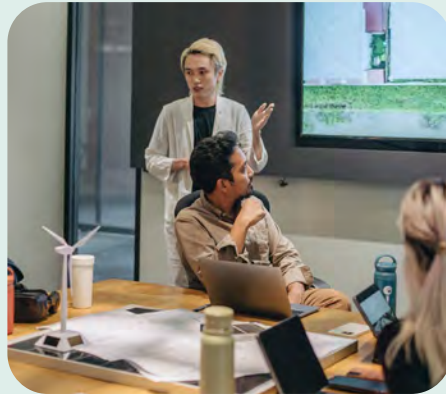
Energy management ISO 50001