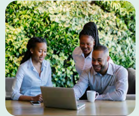
Additional focus courses