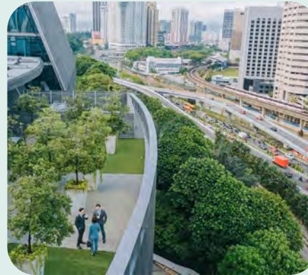
Greenhouse gases and Net Zero