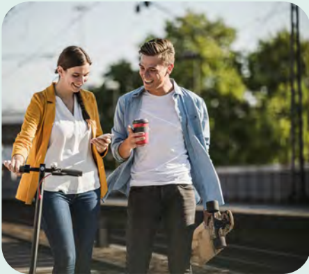
Environmental management ISO 14001

Explore our growing range of courses and qualifications today.