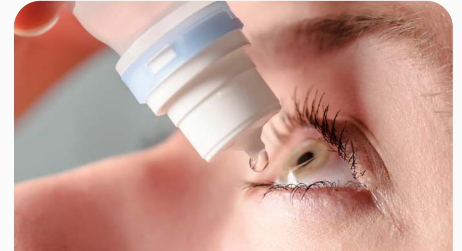
Rule 21 devices