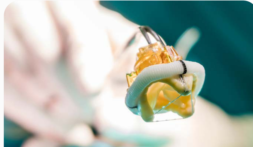
Animal tissue devices