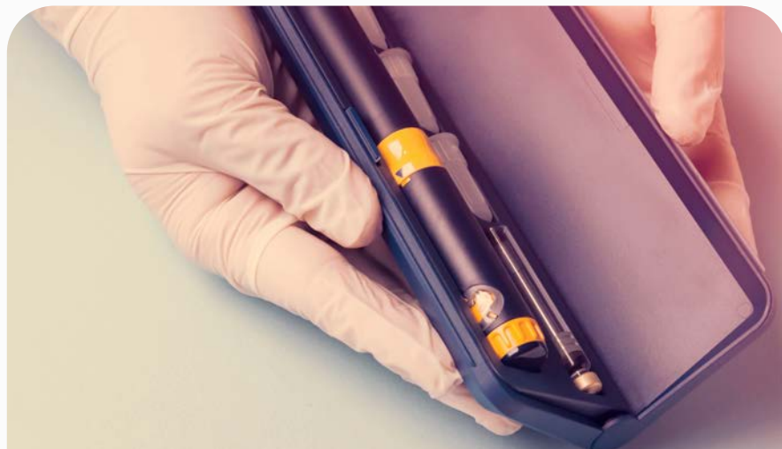
Article 117 devices