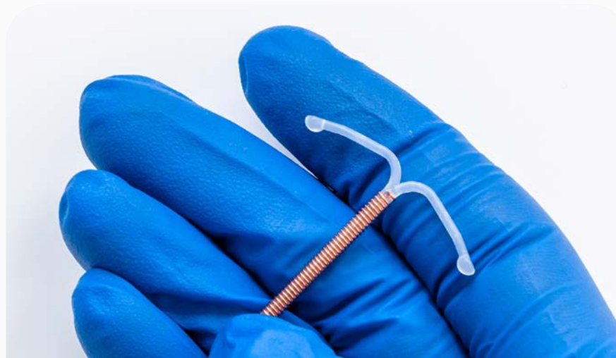
Rule 14 devices