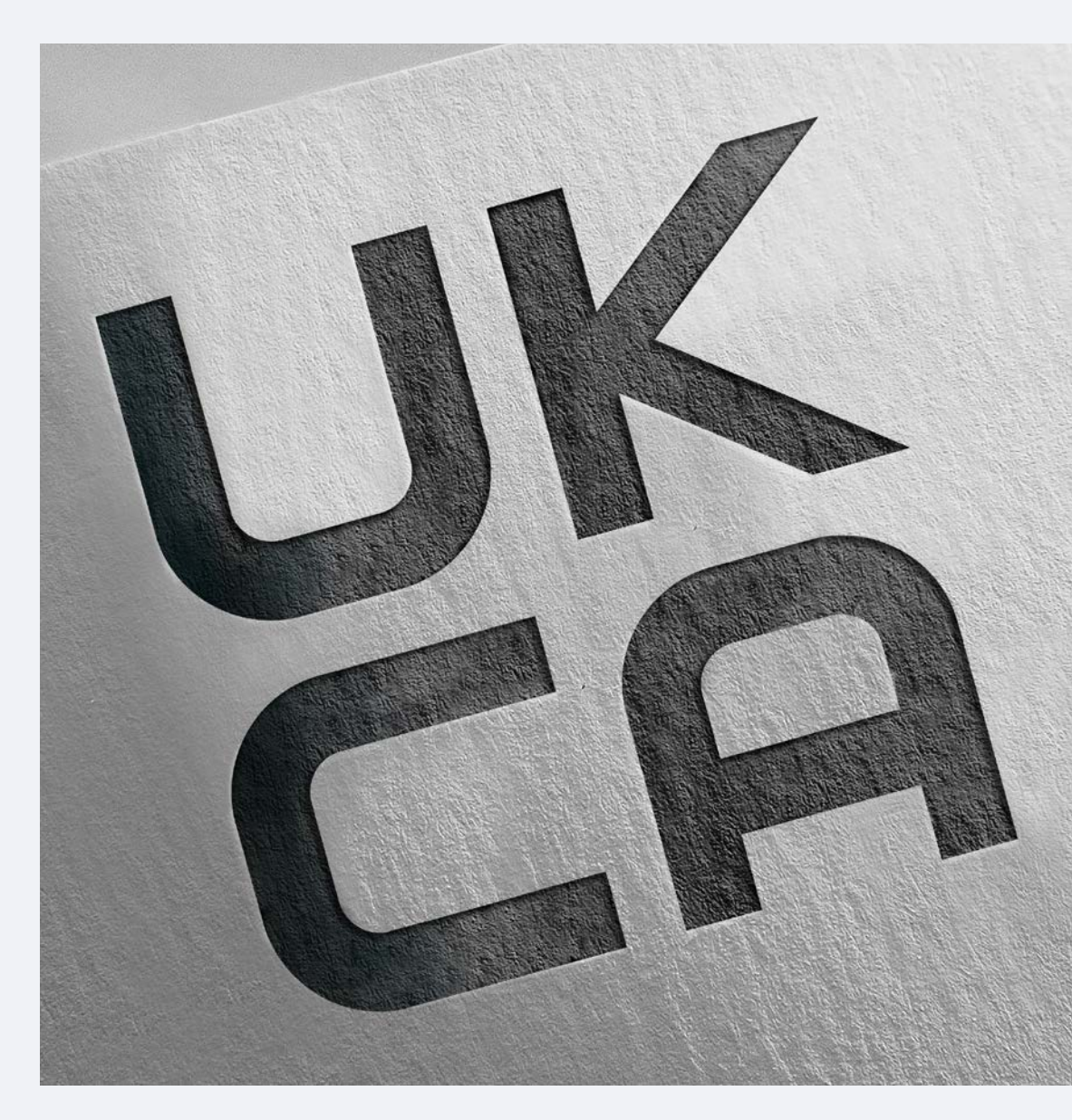
DISCLAIMER: Contents and process of this brochure refer only to new UKCA applicants not holding any CE Certificates with BSI.