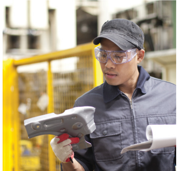
Checking and recording defects in production