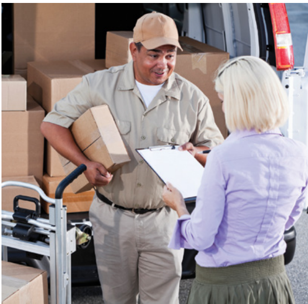
The benefits of conformance can include improving levels of customer satisfaction