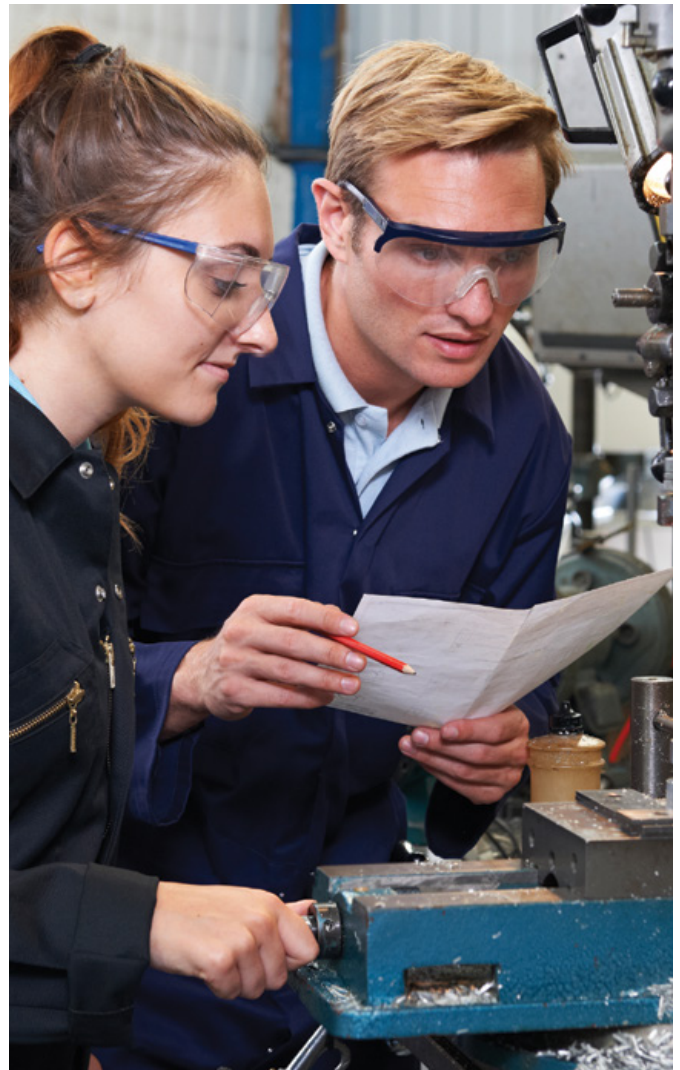
Planning the operational aspects of the QMS

All the above contributes ultimately to an improved customer experience.