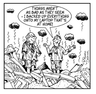
4.Back up everything