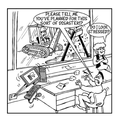
6. Train your colleagues in BCM