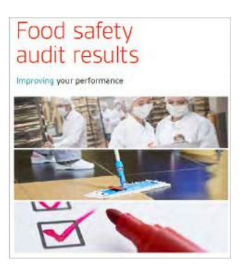
Extract from the BSI whitepaper: Food safety and audit results Improving your performance

These results aren't unique to BSI clients, our list matches the top violations identified by FDA inspectors. In addition to your internal and regular GMP audit programmes, our food safety team used audit data to develop this series of proactive tips to help you identify potential non-conformances.