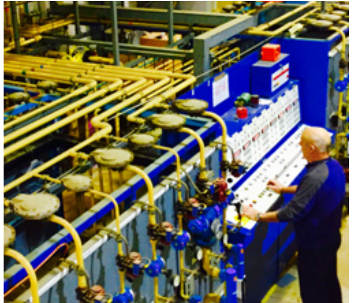
*an additional charge may apply

Clients are welcome to view the testing of their products, to meet with our technical engineers and experience testing first-hand to share with colleagues and technical teams. Plus if you wish to film the testing of your products for promotional or technical purposes, we are happy for you to choose this option*.