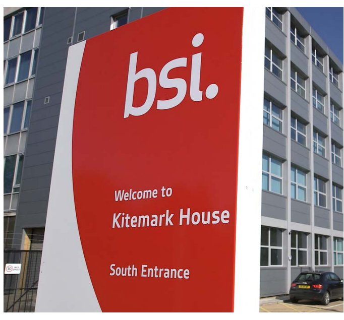
*an additional charge may apply

Clients are welcome to view the testing of their products, to meet our technical engineers and experience testing first-hand to share with colleagues and technical teams. Plus if you wish to film the testing of your products for promotional or technical purposes, we're happy for you to choose this option*.