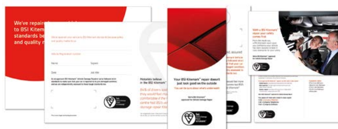
Publicity toolkit examples

• We'll keep in touch with a quarterly newsletter.