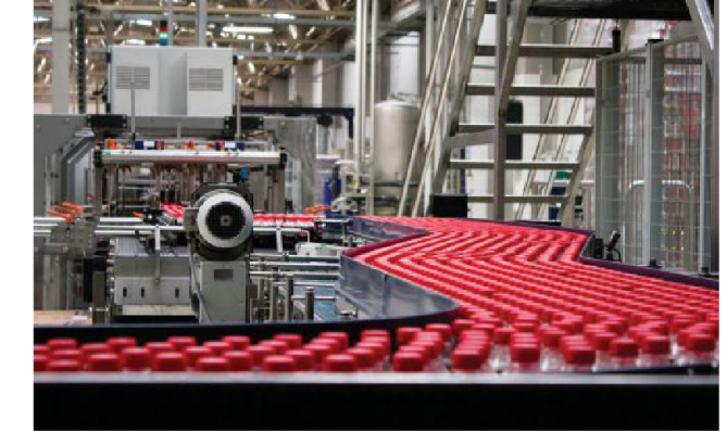
Operational Resilience

By demonstrating the resilience of their organization – through certification and compliance to recognized standards, for example – leaders are also showing that it is reliable, trust-