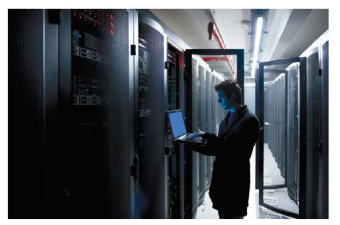
Information Resilience.