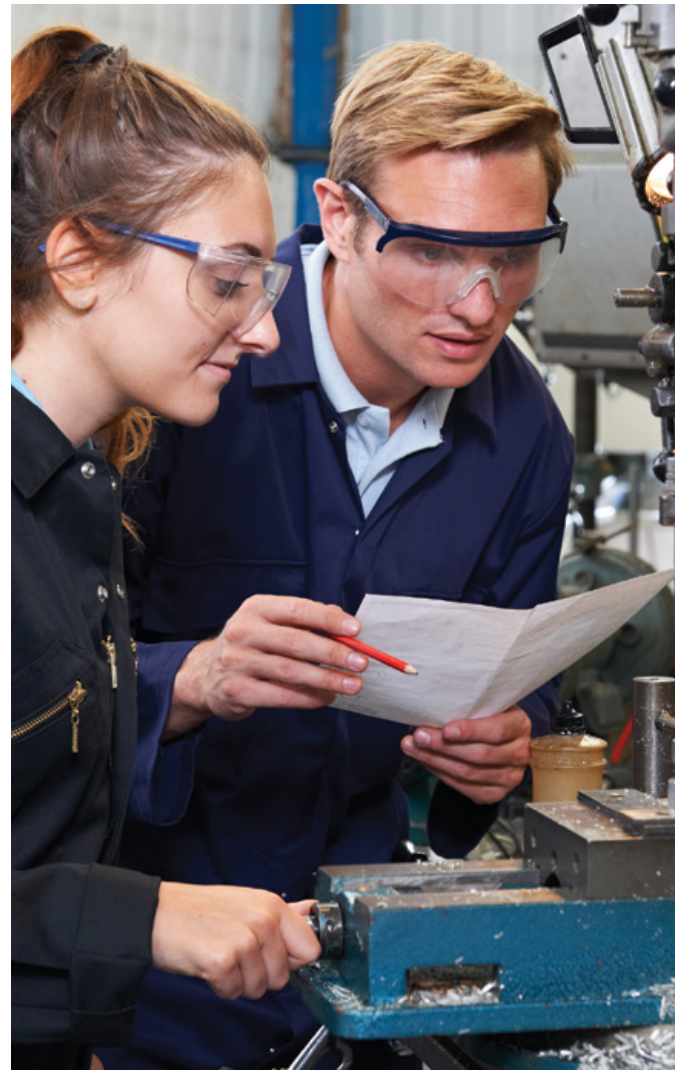
Planning the operational aspects of the QMS

All the above contributes ultimately to an improved customer experience.