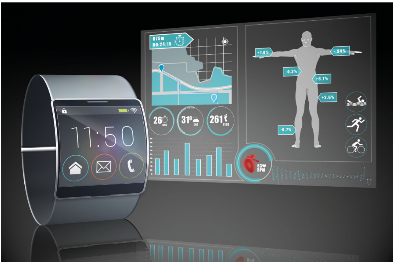
Wrist watch with interface