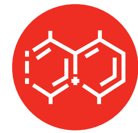
Sulphite in concentrations of 10 mg/kg or more4

Source: Codex Alimentarius, Food Labelling. Provided as a benchmark only. Local regulations may include different and/or additional items.