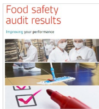
Extract from the BSI whitepaper: Food safety and audit results Improving your performance

These results aren't unique to BSI clients, our list matches the top violations identified by FDA inspectors. In addition to your internal and regular GMP audit programmes, our food safety team used audit data to develop this series of proactive tips to help you identify potential non-conformances.