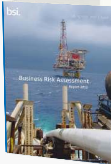
Business Risk Assessment report to client

Risk Management BS ISO 31000 ST Business Continuity ISO 22301 STC