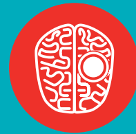
Active Implantable Devices