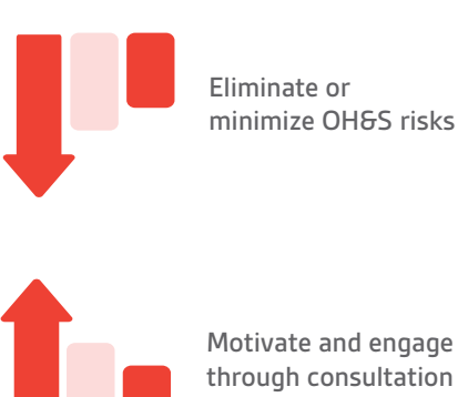
Motivate and engage staff through consultation and participation