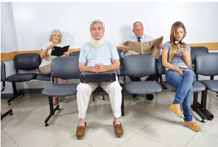
User input and feedback is vital for vigilance

These objectives, however, are not isolated to the EU. In 2012, the Center for Devices and Radiological Health (under USFDA 13 jurisdiction) released its strategic priorities, the first of which emphasizes the complete implementation of a 'total product lifecycle approach' and includes the following post-market goals: