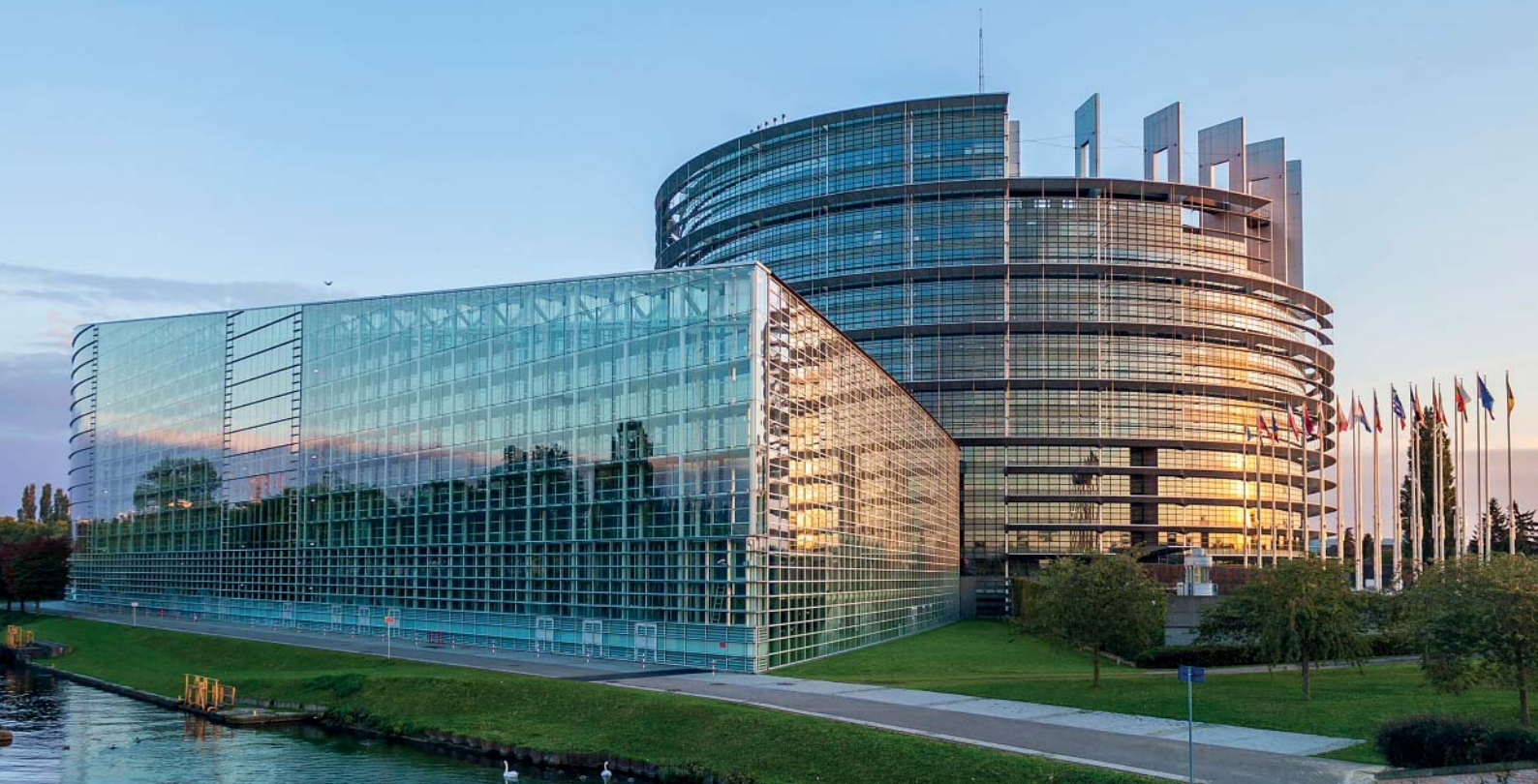
The Louise Weiss building of the European Parliament. Strasbourg, France