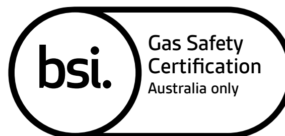
BSI Gas Safety Certification Logo for Australia only

For use by clients with products certified for Gas Safety by BSI in either in Australia and New Zealand.