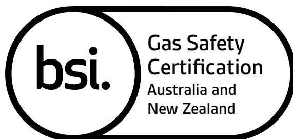
BSI Gas Safety Certification Logo for Australia and New Zealand

For use by clients with products certified for Gas Safety by BSI in either in Australia and New Zealand.