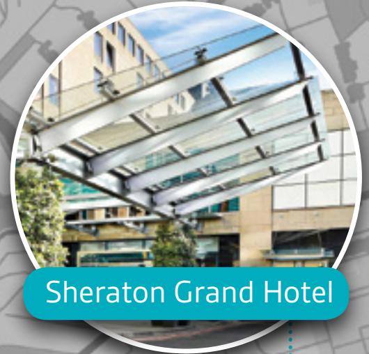
Sheraton Grand Hotel

The event takes place in the Sheraton Grand Hotel on Festival Square, located with views of the magnificent Edinburgh Castle and within easy reach of Edinburgh Old Town and the stunning Royal Botanic Gardens