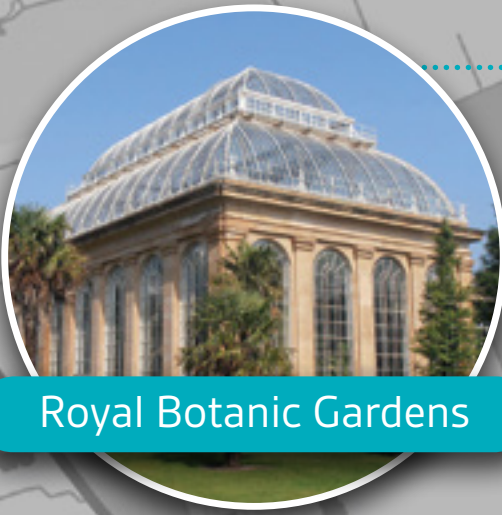
Royal Botanic Gardens