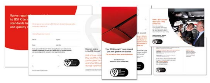
Publicity toolkit examples

Talk us to us about your specific requirements