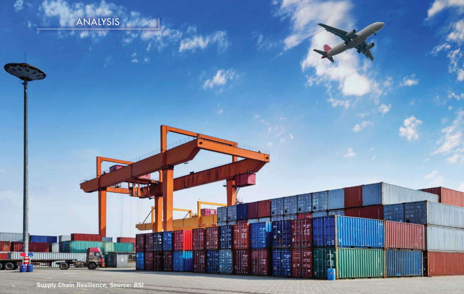
Supply Chain Resilience, Source: BSI