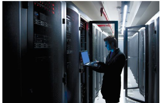
Information Resilience.