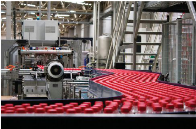
Operational Resilience, Source: BSI

There have been numerous management papers on how and why companies should embrace resilience in order to protect themselves from growing