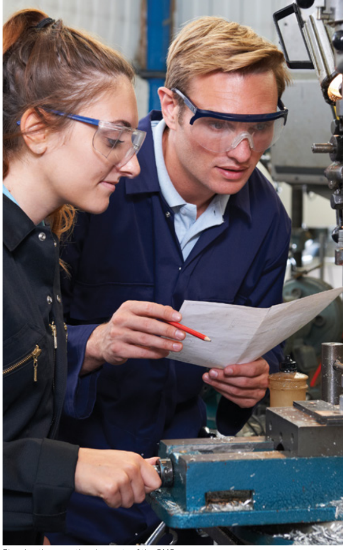
Planning the operational aspects of the QMS