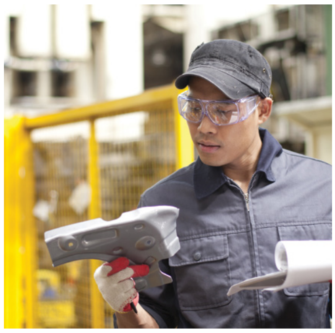
Checking and recording defects in production