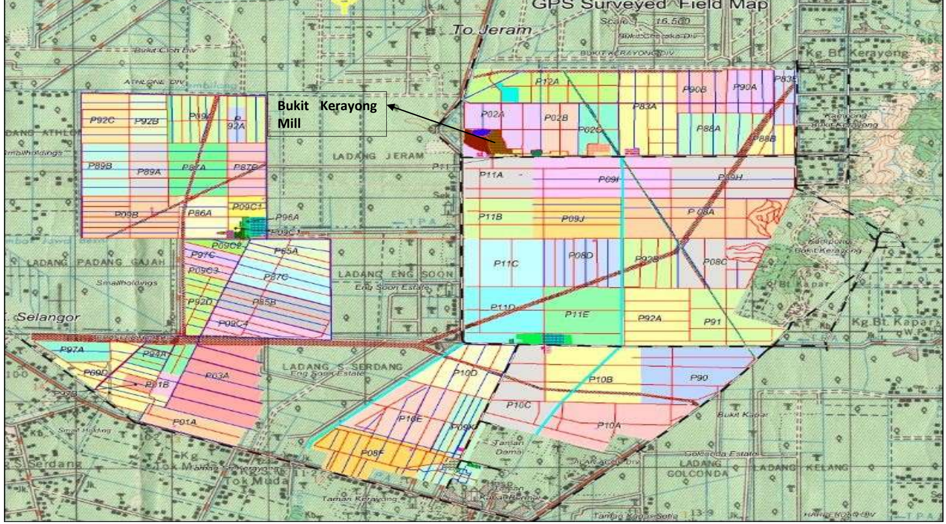
Figure 1: Bukit Kerayong Estate field map and location of the mill