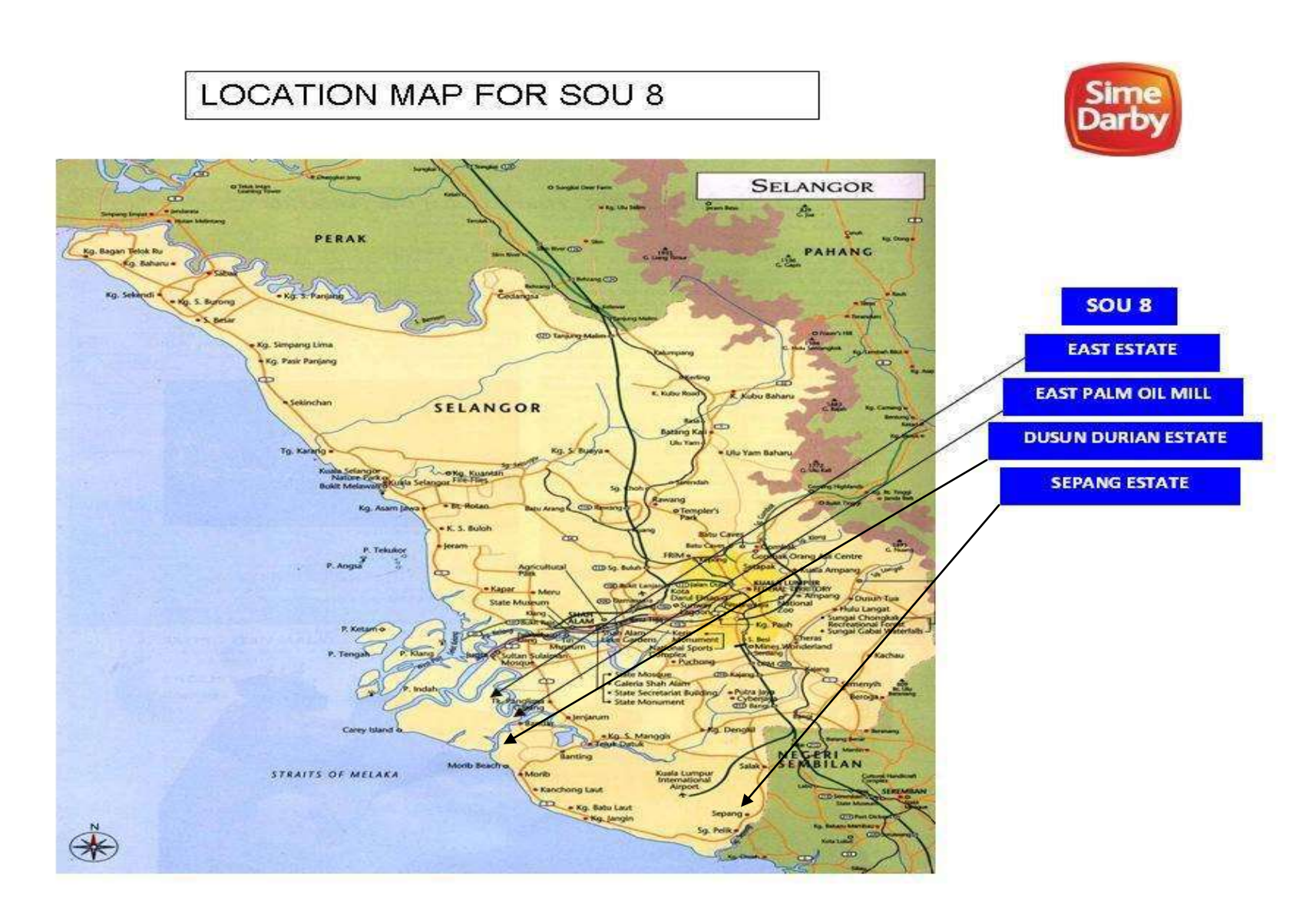
Figure 1: Map showing Location of the East Palm Oil Mill and Supply Base Estates in the state of Selangor, Malaysia.