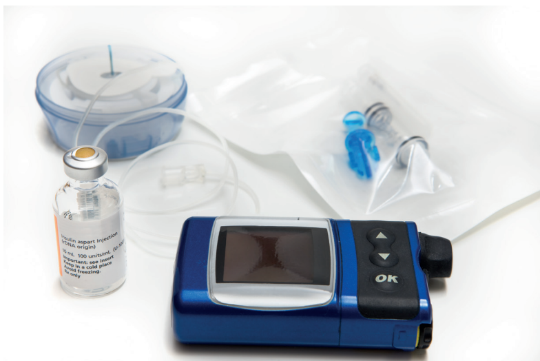
Insulin, pump, infusion set and reservoir