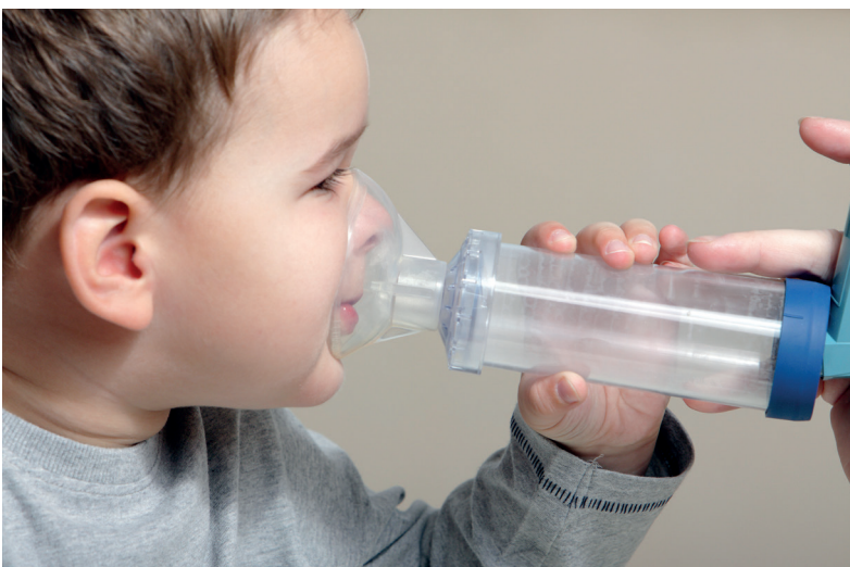
A child with an inhaler

Usability has a major impact on healthcare, particularly with regard to the overall effectiveness of medical devices. Simply put, if usability is lacking, the completion of user tasks may be slower and more error-prone. Therefore,