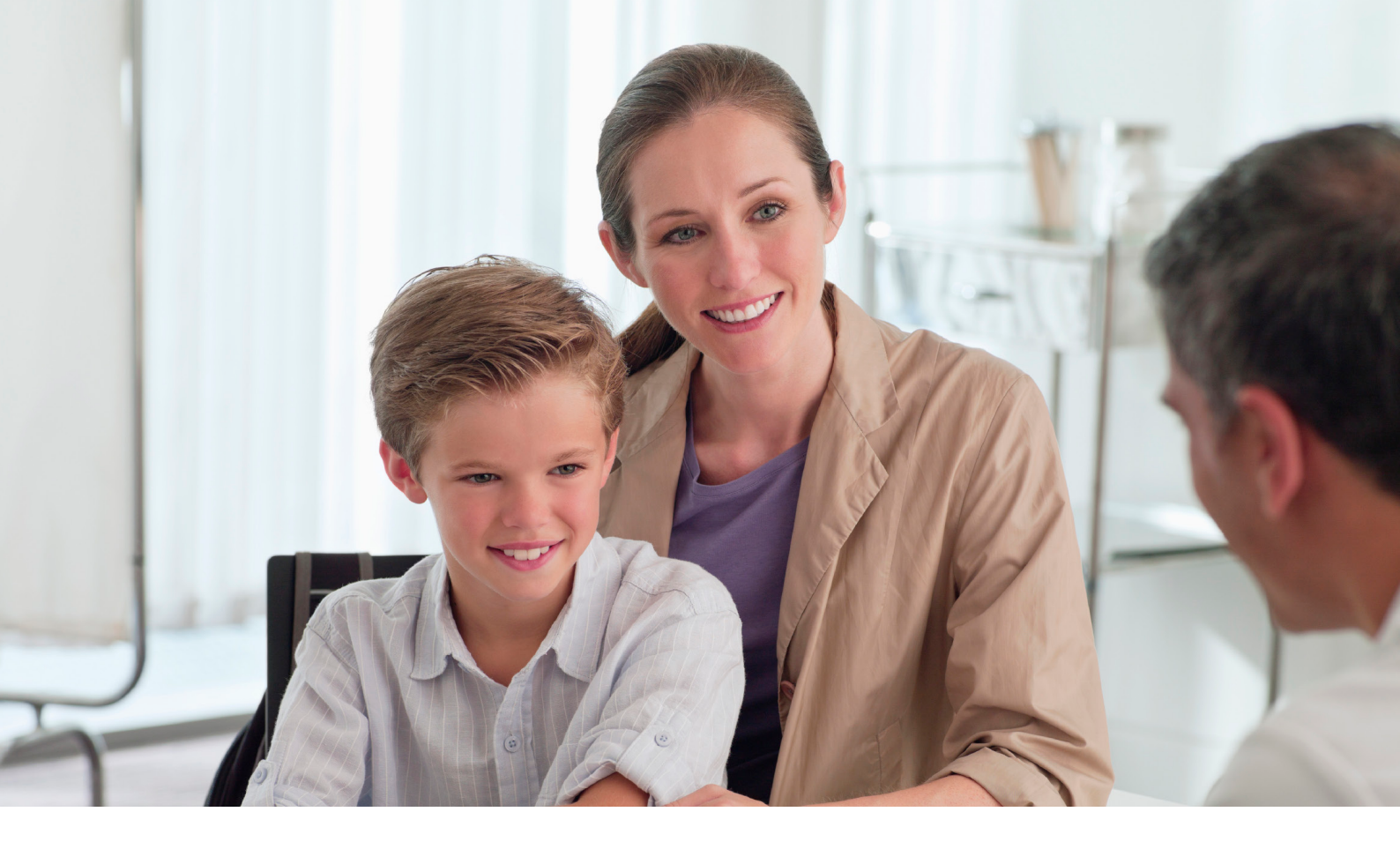
Welcome to BSI's Disability Services. Putting your clients first.