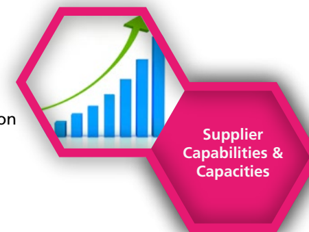
Table 2 – Core topic module C2: Supplier capabilities and capacities

Table 2 sets out the 'essential' and 'discretionary' information items in respect of supplier capabilities and capacities to be provided in accordance with Clause 5 and used in accordance with 6.2a) and 6.2b) respectively, on the basis of the description of expected information provided in relation to each particular information item.