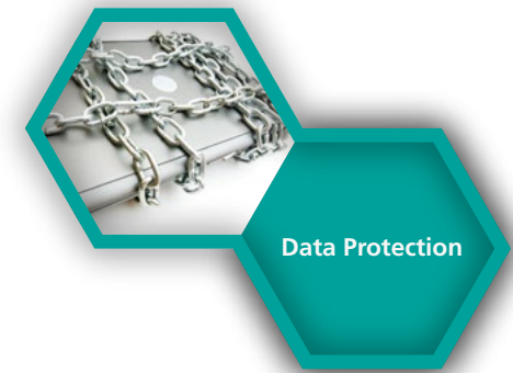
Table 7 – Core topic module C7: Data protection

Table 7 sets out the 'essential' and 'discretionary' information items in respect of data protection and information security management to be provided in accordance with Clause 5 and used in accordance with 6.2a) and 6.2b) respectively, on the basis of the description of expected information provided in relation to each particular information item.