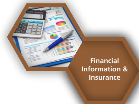
Table 3 – Core topic module C3: Financial Information and Insurance

Table 3 sets out the 'essential' and 'discretionary' information items in respect of financial information and insurance to be provided in accordance with Clause 5 and used in accordance with 6.2a) and 6.2b) respectively on the basis of the description of expected information provided in relation to each particular information item.