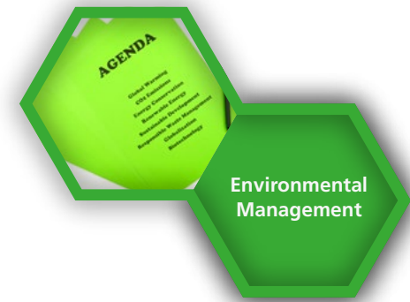
Table 8 – Core topic module C8: Environmental management

Table 8 sets out the ‘essential’ and ‘discretionary’ information items in respect of environmental management system to be provided in accordance with Clause 5 and used in accordance with 6.2a) and 6.2b) respectively, on the basis of the description of expected information provided in relation to each particular information item.