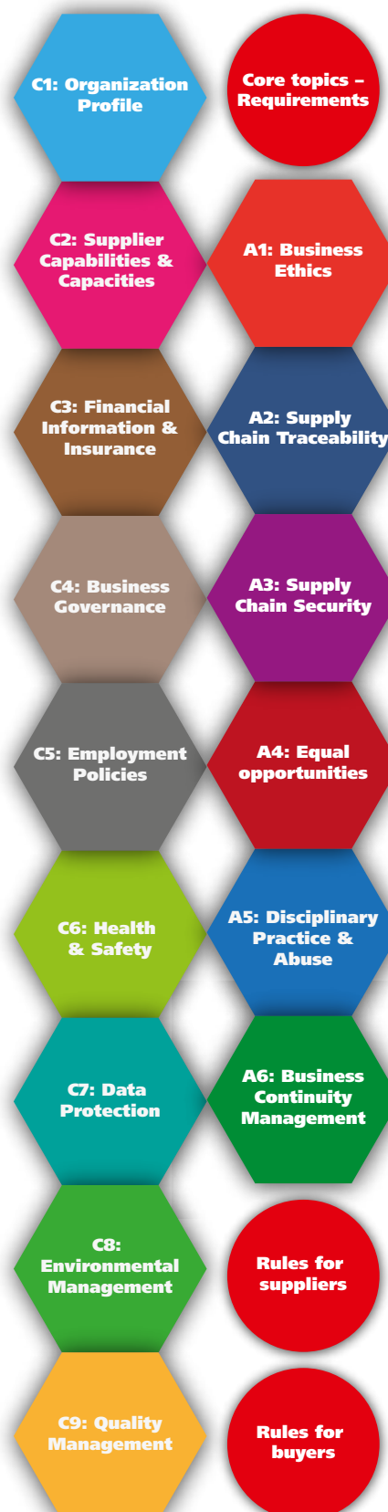
Figure 3 – Index of topic modules (with hyperlinks)

Note to Figure 3 This illustrates the complete range of topic modules included in the PAS 7000 approach to supplier prequalification, also functions as a hyperlinked index from each hexagon in the figure to its respective topic module. For suppliers wanting to review the requirements for information provision or buyers looking to understand the rules for information acquisition, the two red discs at the bottom of the figure are linked directly to the relevant clauses of this PAS. The red disc at the top of the figure provides a link back to the start of the core prequalification topic modules, at Clause 3.