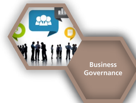
Table 4 – Core topic module C4: Business governance

Table 4 sets out the 'essential' and 'discretionary' information items in respect of business governance to be provided in accordance with Clause 5 and used in accordance with 6.2a) and 6.2b) respectively on the basis of the description of expected information provided in relation to each particular information item.