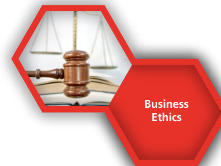
Table 10 – Additional topic module A1: Business ethics

Table 10 sets out the ‘essential’ and ‘discretionary’ information items in respect of business ethics that shall be provided in accordance with Clause 5 and used in accordance with 6.2c) and 6.2d) respectively, on the basis of the description of expected information provided in relation to each particular information item.