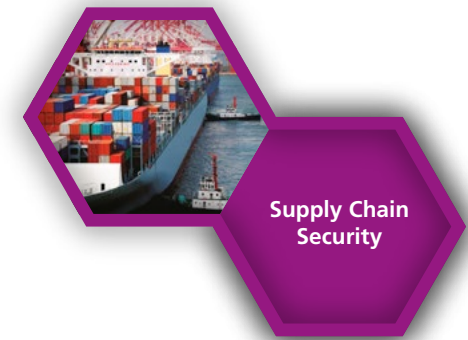
Table 12 – Additional topic module A3: Supply chain security management

Table 12 sets out the ‘essential’ and ‘discretionary’ information items in respect of supply chain security management that shall be provided in accordance with Clause 5 and used in accordance with 6.2c) and 6.2d) respectively, on the basis of the description of expected information provided in relation to each particular information item.