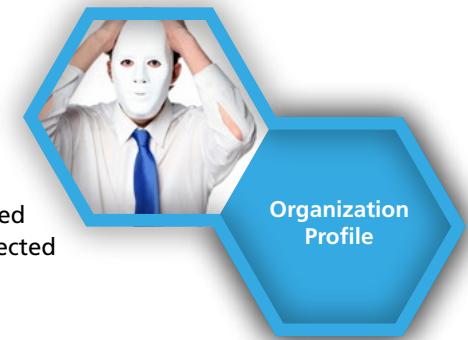
Table 1 – Core topic module C1: Organizational Profile – Supplier identity, key role and contact information

Table 1 sets out the ‘essential’ and ‘discretionary’ information items in respect of organizational profile that shall be provided in accordance with Clause 5 and used in accordance with 6.2a) and 6.2b) respectively, on the basis of the description of expected information provided in relation to each particular information item.