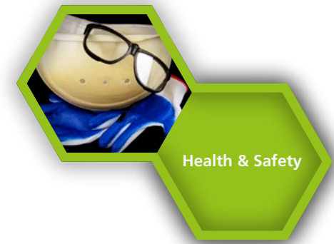
Table 6 – Core topic module C6: Health and safety

Table 6 sets out the ‘essential’ and ‘discretionary’ information items in respect of health and safety to be provided in accordance with Clause 5 and used in accordance with 6.2a) and 6.2b) respectively, on the basis of the description of expected information provided in relation to each particular information item.