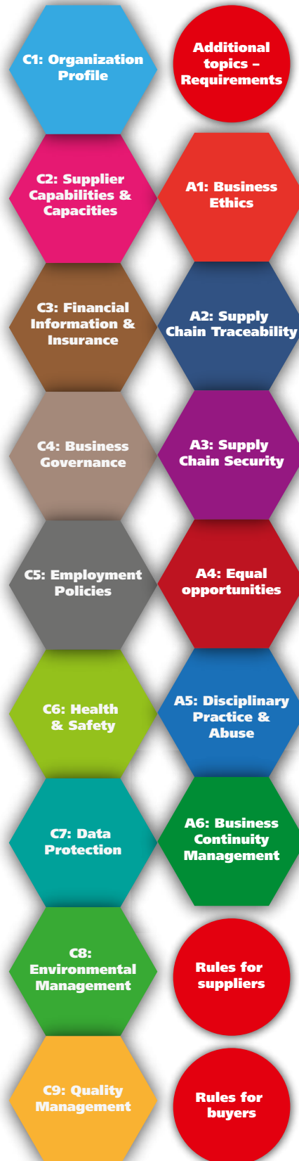
Figure 2 – Index of topic modules (with hyperlinks)

Note to Figure 2 This illustrates the complete range of topic modules included in the PAS 7000 approach to supplier prequalification, also functions as a hyperlinked index from each hexagon in the figure to its respective topic module. For suppliers wanting to review the requirements for information provision or buyers looking to understand the rules for information acquisition, the two red discs at the bottom of the figure are linked directly to the relevant clauses of this PAS.