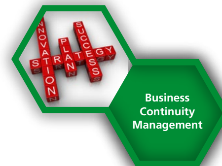
Table 15 – Additional topic module A6: Business continuity management

Table 15 sets out the 'essential' and 'discretionary' information items in respect of business continuity management that shall be provided in accordance with Clause 5 and used in accordance with 6.2c) and 6.2d) respectively, on the basis of the description of expected information provided in relation to each particular information item.