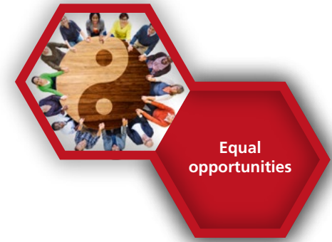
Table 13 – Additional topic module A4: Equal opportunity and freedom of association

Table 13 sets out the ‘essential’ and ‘discretionary’ information items in respect of equal opportunity and freedom of association that shall be provided in accordance with Clause 5 and used in accordance with 6.2c) and 6.2d) respectively, on the basis of the description of expected information provided in relation to each particular information item.