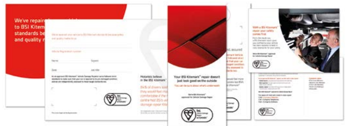
Publicity toolkit examples

Talk us to us about your specific requirements